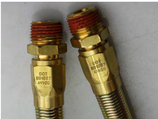
US Federal Dept. of Transport Standards Approval - DOT BB1687 A1/20D